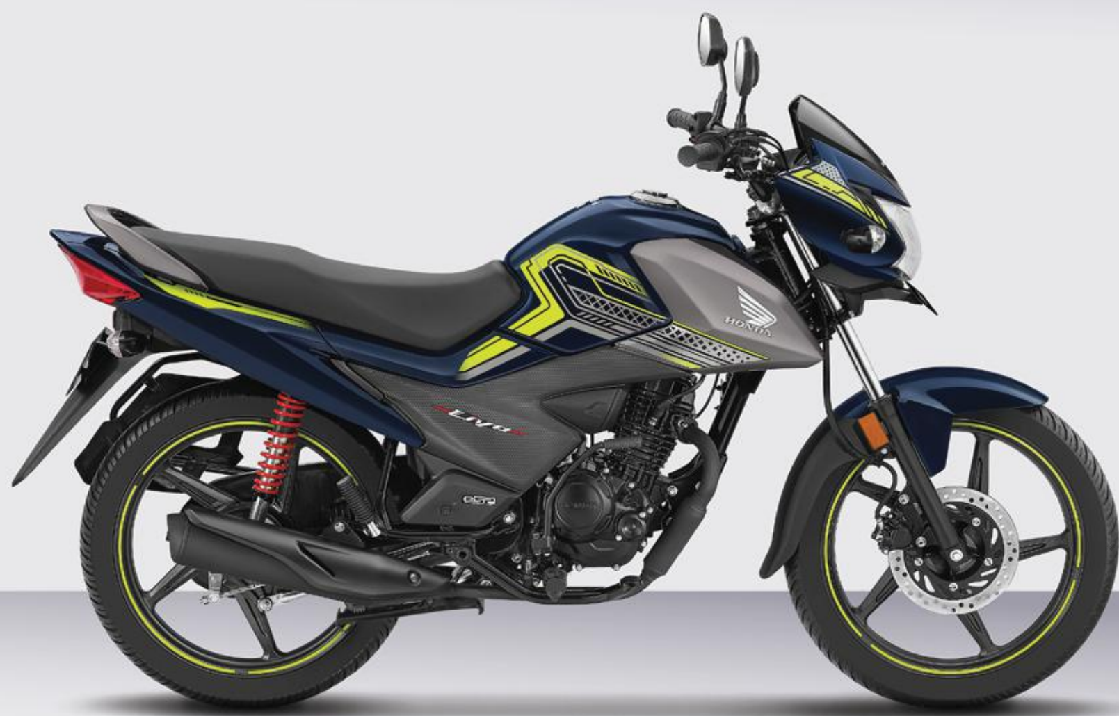
PEARL SIREN BLUE A (Geny Gray Shroud + Green Stripes)